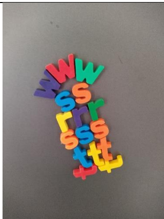
"Leaning Tower of Whilton"